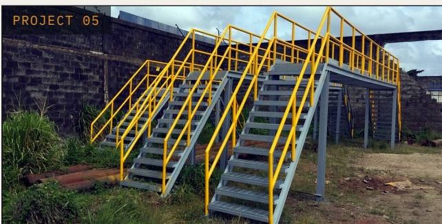
PROJECT 05 STEEL STRUCTURES SINOVENSA Upgrader Fabrication of industrial walkways Morichal, Monagas