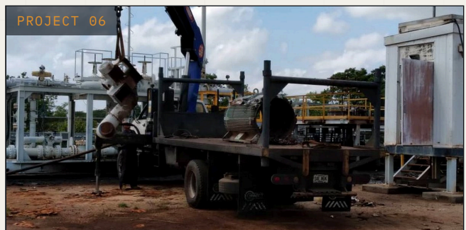
PROJECT 06 ELECTRICAL · MECHANICAL · INSTRUM. PDVSA · San Diego de Cabrutica Facility recovery at a well cluster San Diego de Cabrutica, Anzoátegui