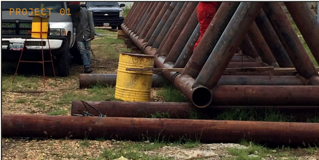
PROJECT 01 FLARE SYSTEMS PetroIndependencia Plant 34 m flare — engineering, fabrication & installation Orinoco Oil Belt