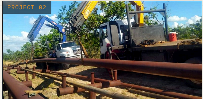
PROJECT 02 LINES & PIPING PDVSA · San Diego de Cabrutica Crude and diluent line replacement San Diego de Cabrutica, Anzoátegui