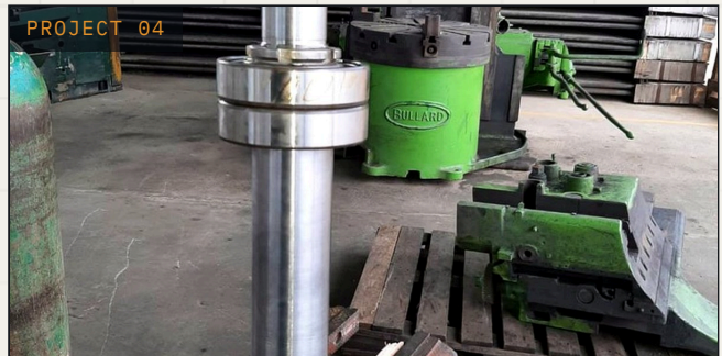
PROJECT 04 ROTATING EQUIPMENT PetroCedeño Upgrader, S.A. Pump and motor repair Jose Industrial Complex, Anzoátegui