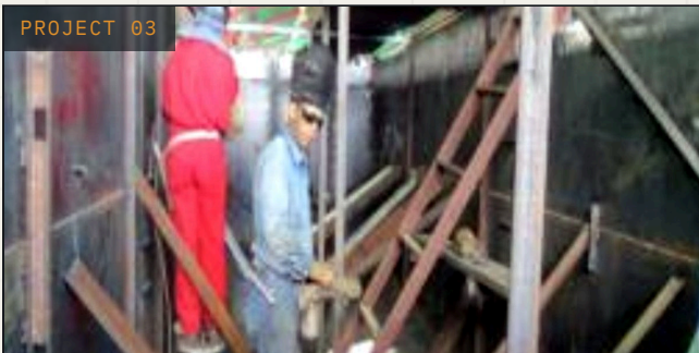
PROJECT 03 STORAGE TANKS Oil & gas sector 500-barrel crude tanks (API 650) Eastern Venezuela